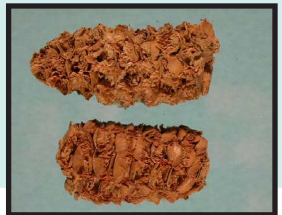
Ancient corncobs from the Vizcaino Collection.

The Pinto Canyon region has been understudied archaeologically, yet, it does not stretch the truth to postulate that the distinct behavioral signatures at all three sites suggest more variability in the Late Prehistoric record of the Big Bend than has been previously recognized. Furthermore, our testing of Tres Metates, Potsherd and Boulder Shelters has provided only the barest hint of the rich archaeological record to be found in Pinto Canyon. The evidence from these three sites definitively shows the region was a major occupation zone for foragers making their living in the harsh, yet beautiful, rimrock country.