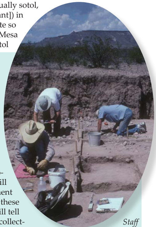
Staff members excavate units at the Paradise site.

Analysis of the wood and soil samples is ongoing. Examination of the soil samples for both micro- and macro-biological evidence will help us understand the environment of 4,000 years ago and the diet of these people, and the wood samples will tell us what wood species they were collecting for fuel. In the ensuing months we should learn much more about lifeways of the inhabitants of the site and, by extrapolation, the other Middle Archaic groups who roamed the Big Bend between 2500–1000 B.C.