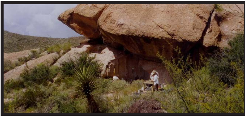
CBBS staff screen for artifacts at Boulder Shelter.

very near a concentration of ribs and vertebrae. A complete astragalus (an accessory bone of the heel) was sent for radiocarbon analysis with the result coming back as modern! Further analysis of the bones revealed they belonged to a juvenile sheep or goat—domesticated animals that would not have been on the Livermore menu. Clearly, with modern bones being found in seemingly direct association with prehistoric arrow points, the disturbance in the upper centimeters of Potsherd Shelter, most likely from looting, javelinas, transient activity, or a combination of the three, has been much more severe than was visible prior to excavation.