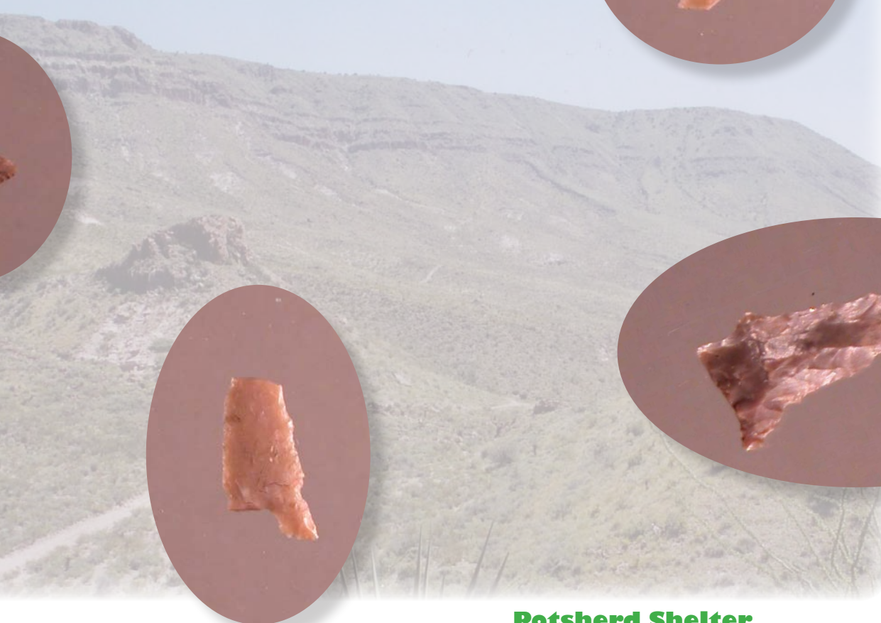
Projectile points excavated from Potsherd Shelter and the surrounding landscape.

theless, the yucca and other seeds indicate a continued reliance on wild-gathered plants.