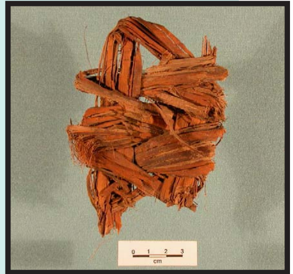
Objects from the Vizcaino collection include a sandal fragment (above), a stone pendant (below), and a piece of stitched gourd (bottom).

The fact that these artifacts were excavated without scientific methodology greatly limits their interpretive value. Nevertheless, Vizcaino’s collection still represents a small piece of a larger puzzle that can contribute to our knowledge of the Pinto Canyon area. Only a small number of archaeological projects have been conducted in the region in the past 50 years. During this time, efforts have focused more on collecting artifacts than their analysis—which make the need to properly document the area all the more urgent. The recent excavations on Pinto Canyon Ranch—along with extensive reconnaissance by the current ranch owner—are gradually building a more coherent picture of past occupations of the area, which in turn contribute to a better understanding of the past in the Trans-Pecos and northern Mexican regions.